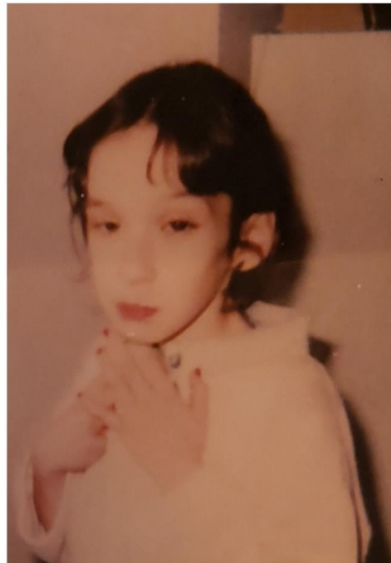
Child’s Condition after Seizure by Ohel

“Shonda” - Yiddish for Profound Community Shame