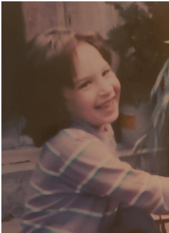
Happy, Healthy Child Living with Mother