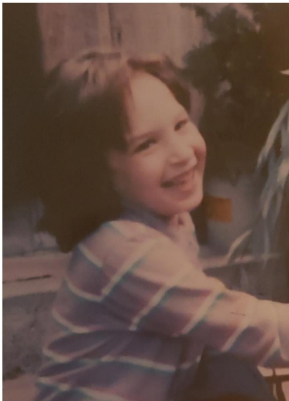
Happy, Healthy Child Living with Mother