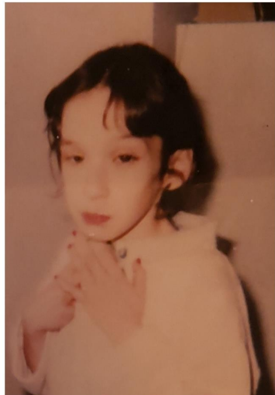
Child’s Condition after Seizure by Ohel

“Shonda” - Yiddish for Profound Community Shame